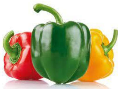
Figure 1. The physical appearance of BP fruits

The idea of a "circular economy" is develop via promoting a shift from the standard "take-make-use-dispose" business model to one that uses recycling, repair, sharing, remanufacturing, refurbishment and reusing to create a system with closed loop that reduces both the consumption of natural resources as well as production of carbon emissions, contaminants, and waste. Food waste and losses that contain high-added-value molecules present a range of chance for evaluation as well as repurposing as envisioned by the regenerative economy theory (24).The bio-refineries are one of the solutions for valorizing agro-food industry leftovers that can have a beneficial environmental effect due to their flexibility and interest in adopting the concepts of