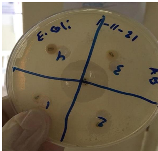
Figure 2: Zone of inhibition (in mm) of commercial antibiotics sensitivity test against tested pathogenic bacteria.